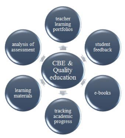
Figure 1. Functions of CBE in terms of quality education (Source: Hsiao, 2020)

In CBE, the educational situation is transformed from concept and theory to new reality (Goldhamer, 2020), and also more emphasis is given to professional activities and advanced curriculum. It helps for real-time assessment of students' learning and provides a platform for learning by emphasizing the competencies and proficiencies of students.