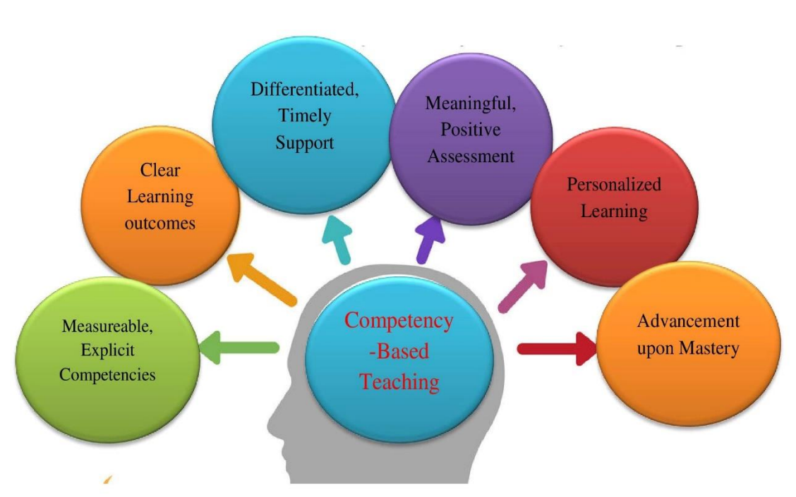
Figure 2. Salient features of CBE

Volume 5, Issue 1, Jan.-Feb., 2024 pp: 302-310 www.ijemh.com